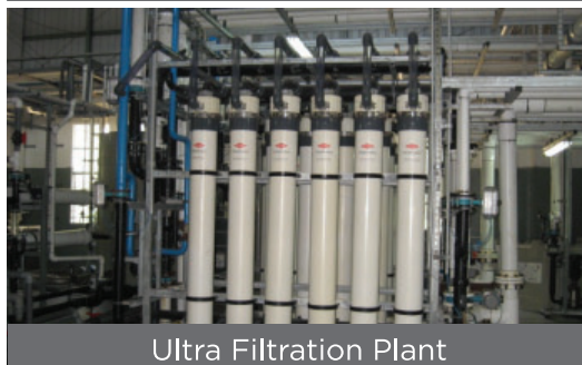
Ultra Filtration Plant