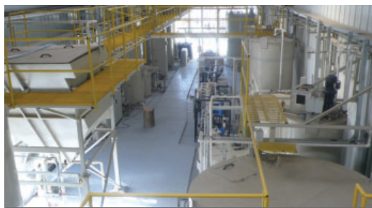
Effluent Treatment Plant