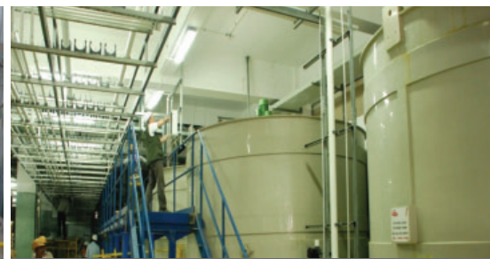
Effluent Collection Tanks