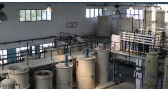
ETP & Recycling Plant