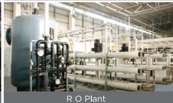
R O Plant