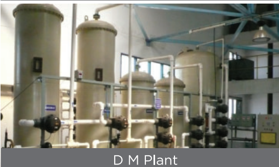
D M Plant