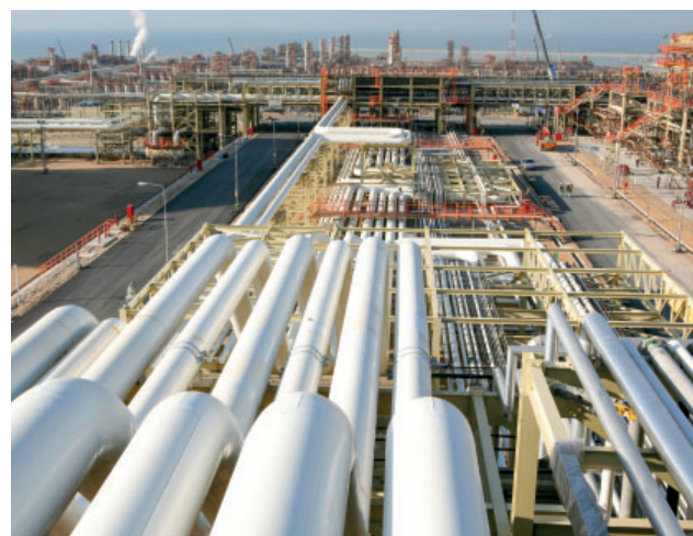
Transocean paints protect onshore- and offshore facilities in the world largest gas reserves: the South-Pars Gas Fields.

Electrochemical Impedance Spectroscopy which is introduced by Transocean to its customers. In short, the EIS technique makes it possible to measure the barrier properties of a coating (and therefore corrosion resistance) without destructing the coating. Corrosion resistance of paint is typically tested by using accelerated salt-spray, a test which has poor correlation with practice and is time consuming as often a full test requires 6 months. By using EIS, only a short period of 1 day up to 3 weeks is required to establish the intrinsic anti-corrosive properties of a paint. EIS also offers tremendous advantages for field inspection as it is non-destructive and is able to detect corrosion processes beneath a coating system before it is even visible from the outside. As such, by using EIS as inspection or monitoring tool, it provides reliable information that can be used in maintenance planning programs. Transocean Coatings has introduced EIS as a monitoring and evaluation tool to its clients and as such companies like Taqa International and Wintershall have introduced EIS in their paint specifications.